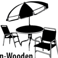
Non-Wooden Outdoor Patio Furniture Except Cushions & Wood Frames