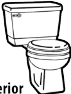
Exterior Toilet Bowl Surfaces