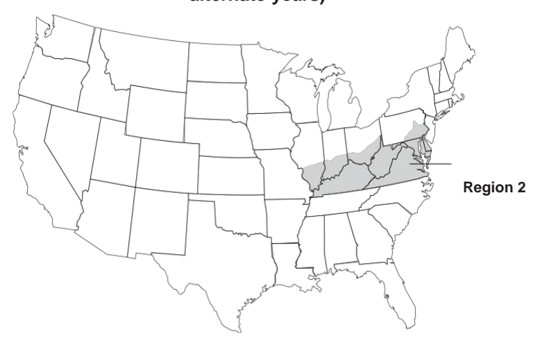
REGION 2 - Includes the following states or portion of states where MANA 14204 may be applied: Delaware, Kentucky, Maryland, Virginia, West Virginia, South of Interstate 70 in the following states: Illinois, Indiana and Ohio and all areas South of Interstate 80 to the intersection of U.S. Highway 15 and East of U.S. Highway 15 and U.S. Highway 522 in Pennsylvania.