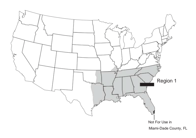
REGION 1 - Includes the following states or portion of states where MANA 14204 may be applied: Alabama, Arkansas, Florida (except Miami-Dade County), Georgia, Louisiana, Mississippi, Missouri (counties of Bollinger, Butler, Cape Giradeau, Dunklin, Madison, Mississippi, New Madrid, Pemiscot, Perry, Ripley, Scott, Stoddard and Wayne), North Carolina, Oklahoma (East of U.S. Highway 75 and East of Indian Nation Parkway), South Carolina, Tennessee, and Texas (includes area east of U.S. Highway 77 to State Road 239 including all of Calhoun County).