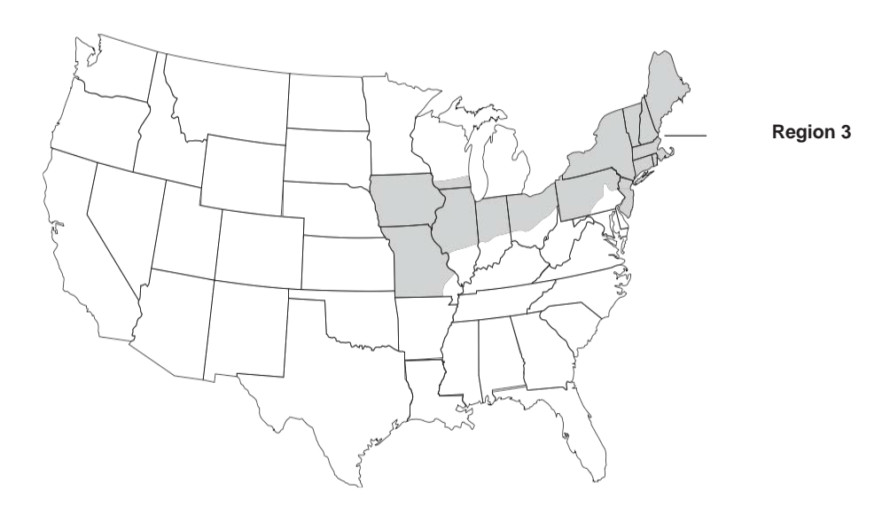
REGION 3 - Includes the following states or portion of states where MANA 14204 may be applied: Connecticut, Iowa, Maine, Massachusetts, Missouri (all counties except for those listed in Region