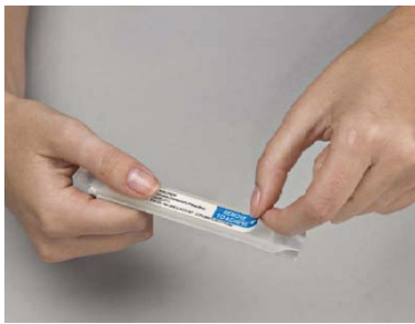
[Illustration] [Picture] [Figure] [2] [B]