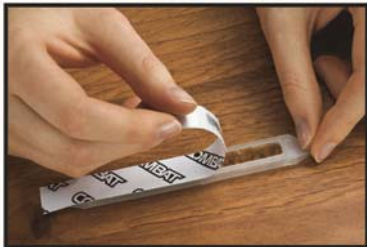
[Illustration] [Picture] [Figure] [3] [C]