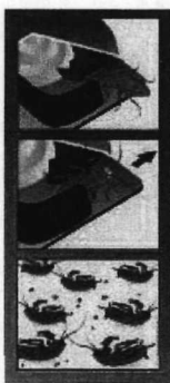
OPTIONAL Example of illustrations to depict how this product works.