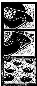
OPTIONAL Example of illustrations to depict how this product works.