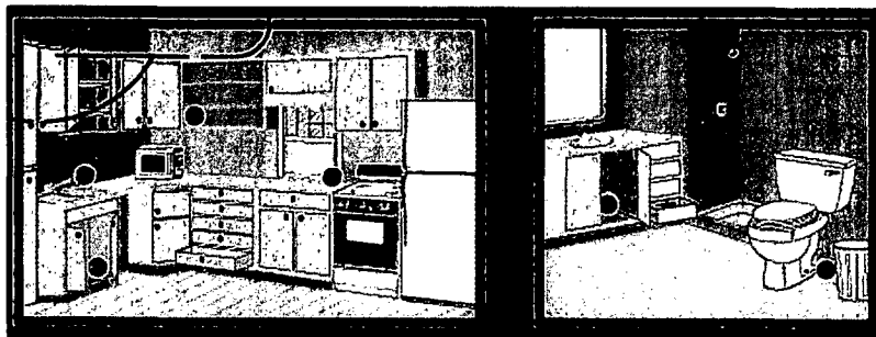
OPTIONAL Example illustration of suggested bait station placement sites.