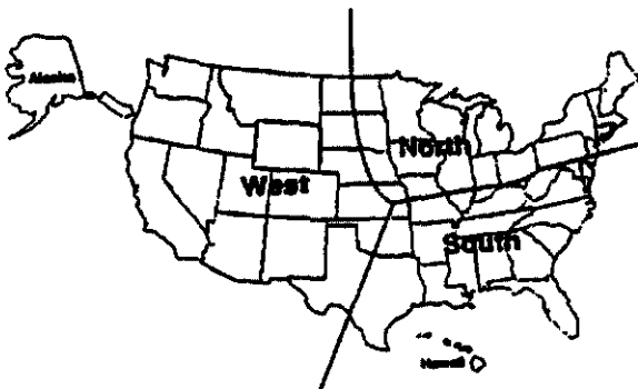
Annual Weeds Rate Table, North and South Regions

Refer to this map for location of the regions listed in the annual weed tables below.