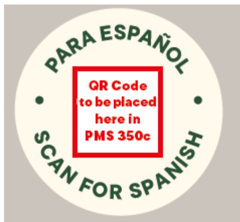
Image with QR link to website with Spanish translation of label text

The term "this product" used throughout this document may be replaced with the marketed product brand name. punctuation and plural/singular word forms may be adjusted to allow for grammatical correctness.