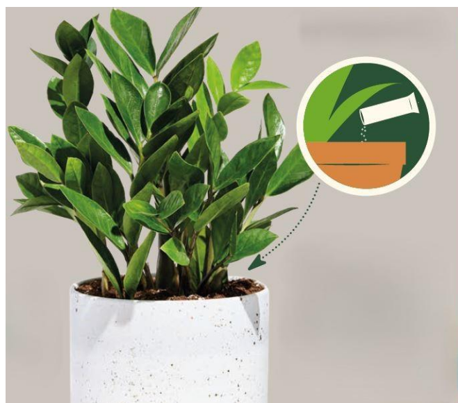
Image of a houseplant with icon to show how to apply product.

[internal identification/SKU number/Mat Code #/Product Code #]