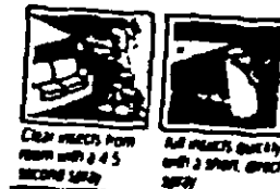
Clear insects from room with 4-5 second spray

Spray directly onto insects and into hiding places, for fast effective results