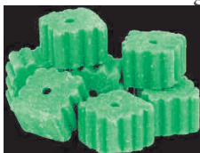
Image may not be representative of a label-consistent bait placement.