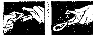
Figure 1. Disinfect pliers prior to use. Place female tag under clip by depressing lever. Collar on tag must be pointing down.

For adequate control of horn flies, attach one tag per animal. For optimum control of horn flies, control of ear ticks, and as an aid in the control of face flies, lice, stable flies and house flies attach one tag to each ear (two tags per animal). Replace as necessary. These tags have been proven to be effective against pyrethroid resistant horn flies for up to five months. Apply as indicated (Figures 1-4). Calves less than 3 months of age should not be tagged as ear damage may result. Remove tag prior to slaughter.