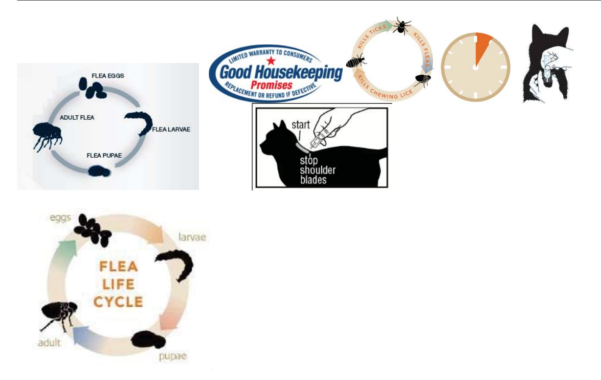
[Flea life cycle diagram] [Flea Life Cycle]