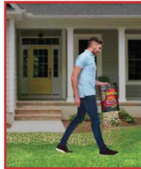
Creates a BUG BARRIER Around Your Home