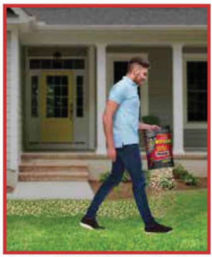
Creates a BUG BARRIER Around Your Home