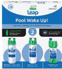
Option 1 for pools

[The following images are representative of current products and may or may not appear on product labeling]