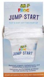
Option 2 for hot tubs or swim spas