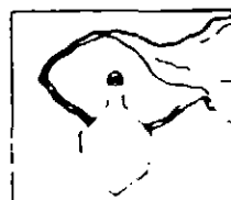
Figure 4. When properly positioned the tag should hang as shown.