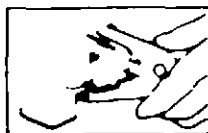
Figure 2. Slide male button on pin until it projects through tip. Tag and button are now ready for application. Disinfect pliers and tags prior to application.