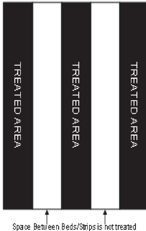
Figure 1. Bedded/Strip Application (1 acre application block)

The application block size is the acreage within the perimeter of the fumigated portion of a field (including furrows, irrigation ditches, roadways). The perimeter of the application block is the border that connects the outermost edges of total area treated with the fumigant product.