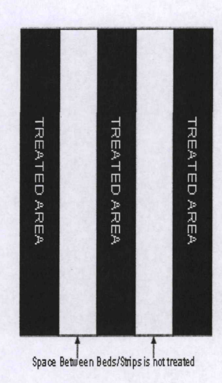
Figure 1, Bedded/Strip Application (1 acre application block)

The "broadcast equivalent rate" must be calculated with the following formula: