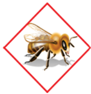
PECAN (For Residential Areas Only)