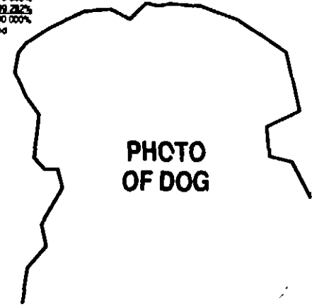
PHOTO OF DOG