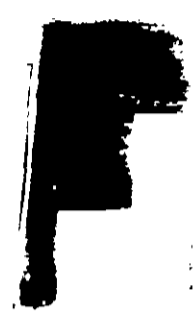
CLEANOUT NOZZLE WITHOUT REFILL CARTRIDGE