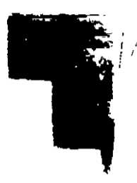
ACTIVE NOZZLE WITH COPPER SULFATE REFILL CARTRIDGE