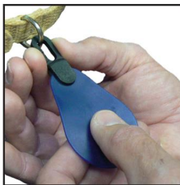
STEP 2 Close clasp and press together until it clicks into place.