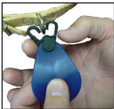
STEP 1 Open clasp and slide both halves around “D” ring on collar.

Remove medallion from package and attach to “D-ring” on existing collar as illustrated in Steps 1 through 3.