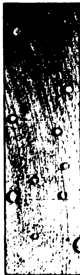
# 406 CEDAR GRAY