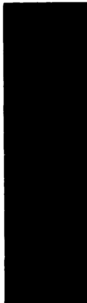
# 410 MAHOGANY