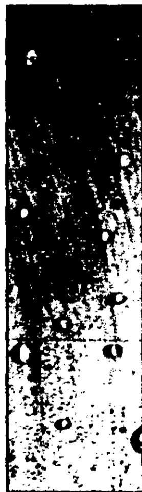
= 406 CEDAR GRAY

For extra protection apply a second coat of Wood Preservative within one hour of the first coat. Where dipping method of application is used, keep wood in the Preservative for minimum of five minutes.