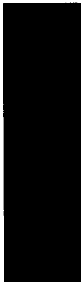
# 403 REDWOOD

AVAILABLE IN FIVE BEAUTIFUL COLORS & CLEAR