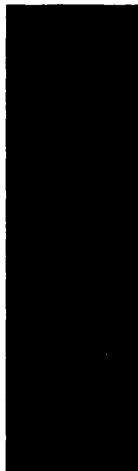
= 409 TEAKWOOD