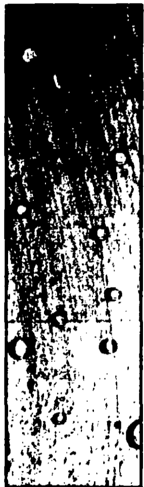
# 406 CEDAR GRAY