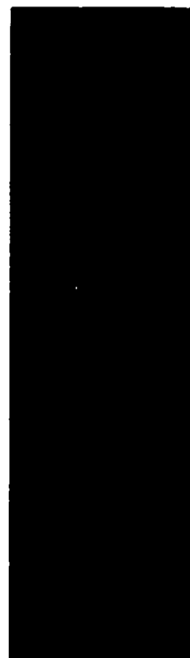
# 409 TEAKWOOD