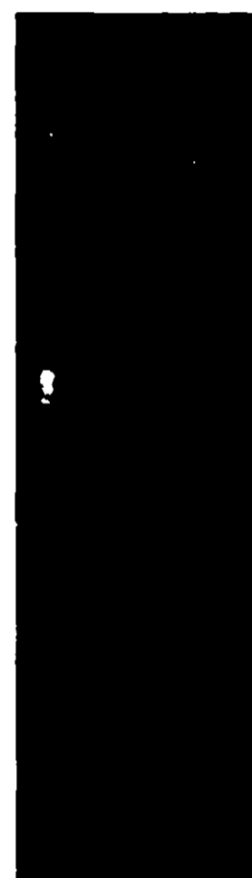
= 404 CHESTNUT BROWN