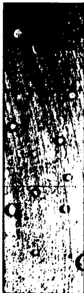
# 406 CEDAR GRAY