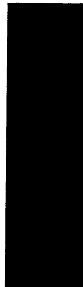
# 403 REDWOOD

AVAILABLE IN FIVE BEAUTIFUL COLORS & CLEAR