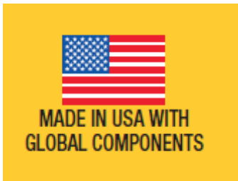
{Made in USA with Global Components}