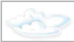
[graphic depicting outdoor fresh scent]