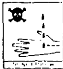
CAN KILL YOU BY SKIN CONTACT

This product can kill you if swallowed even in small amounts. Spray mist or dust may be fatal if swallowed.