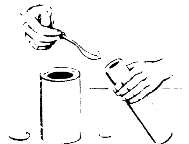
REFILL FOR SQUEEZE DUSTER

NOTICE: Seller warrants that the product conforms to its chemical description and is reasonably fit for the purposes stated on the label when used in accordance with directions under normal conditions of use, but neither this warranty nor any other warranty of merchantability or fitness for a particular purpose, express or implied, extends to the use of this product contrary to label instructions, or under abnormal conditions, or under conditions not reasonably foreseeable to seller, and buyer assumes the risk of any such use.