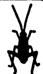
Roaches & Waterbugs