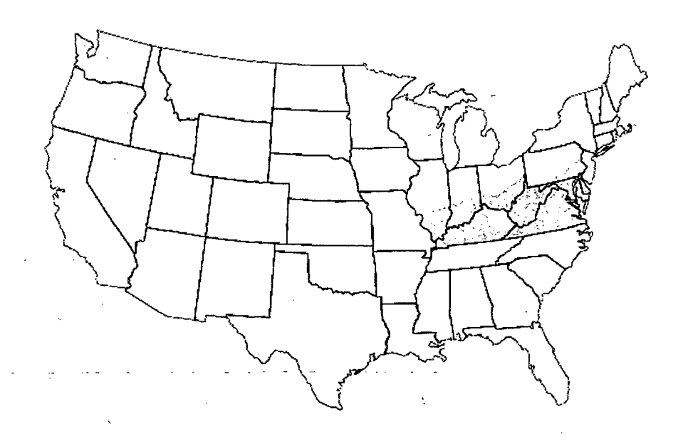
REGION 2 (Maximum Rate: 1.6 pints per acre, alternate years.)

REGION 2 - Includes the following states or portion of states where this product may be applied: Delaware, Kentucky, Maryland, Virginia and West Virginia. South of Interstate 70 in the following states: Illinois, Indiana and Ohio and in Pennsylvania (all areas South of Interstate 80 to the intersection of U.S. Highway 15 and East of U.S. Highway 15 and U.S. Highway 522).