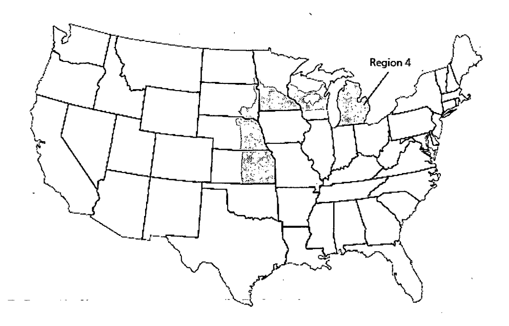
REGION 4 (Maximum Rate: 1 pint per acre, alternate years)

REGION 4 - Includes the following states or portion of states where this product may be applied: Kansas (all counties East of or intersected by U.S. Highway 281), Michigan (Southern Peninsula), Minnesota (all areas South of Interstate 94), Nebraska (all counties East of or intersected by U.S. Highway 281), and Wisconsin (all areas except those in Region 3, South of Interstate 94 from Minnesota state line to Eau Claire and South of U.S. Highway 29 from Eau Claire to Green Bay plus Barron, Chippewa, Clark, Door, Dunn, Eau Claire, Kewaunee, Marathon, Menominee, Oconto, Polk, Shawano, and St. Croix counties). The following counties are excluded: Adams, Marquette, Portage, Waupaca, Waushara and Wood), North Dakota (all areas East of Interstate 29 from Fargo South to the South Dakota state line), South Dakota (all areas East of Interstate 29 from the North Dakota state line to Watertown, all areas East of Highway 81 from Watertown to Madison and all areas East and South of State Road 34 and U.S. Highway 281 to the Nebraska state line).