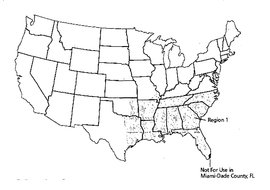
REGION 1 (Maximum Rate: 1.6 pints per acre per year)

REGION 1 - Includes the following states or portion of states where this product may be applied: Alabama, Arkansas, Florida (except Miami-Dade County), Georgia, Louisiana, Mississippi, Missouri (Counties of Bollinger, Butler, Cape Girardeau, Dunklin, Madison, Mississippi, New Madrid, Pemiscot, Perry, Ripley, Scott, Stoddard and Wayne), North Carolina, Oklahoma (East of U.S. Highway 75 and East of Indian Nation Parkway), South Carolina, Tennessee and Texas (all areas East of U.S. Highway 77 to State Road 239, including all of Calhoun County).