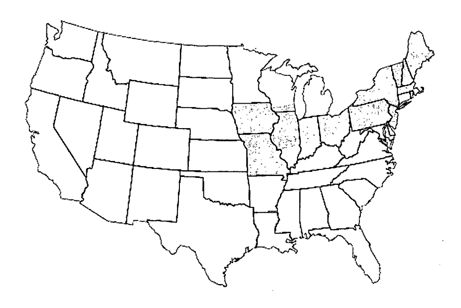
REGION 3 (Maximum Rate: 1.3 pints per acre, alternate years)

REGION 3 - Includes the following states or portion of states where this product may be applied: Connecticut, Iowa, Maine, Massachusetts, Missouri (all counties except for those listed in Region 1), New Hampshire, New Jersey, New York, Pennsylvania (all areas except those listed in Region 2), Rhode Island, Vermont, Wisconsin (South of U.S. Highway 18 between Prairie Du Chien and Madison, and South of Interstate 94 between Madison and Milwaukee) and North of Interstate 70 in the following states: Illinois, Indiana and Ohio.