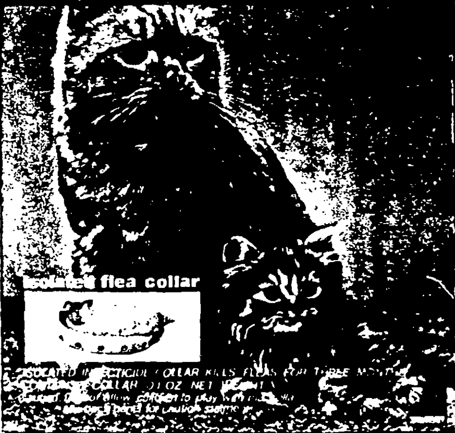
Isolated flea collar

AIDS IN TICK CONTROL - ESPECIALLY IN THE NECK AREA