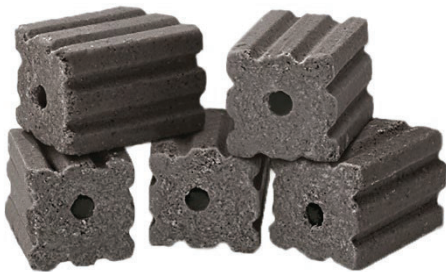
Photo may not be representative of a label-consistent bait placement.