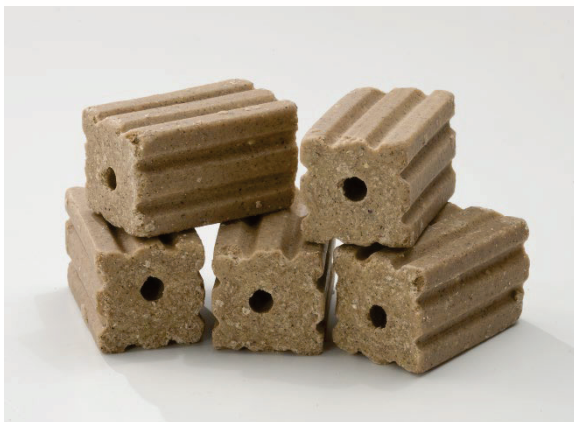
Photo may not be representative of a label-consistent bait placement.