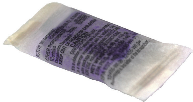
Photo may not be representative of a label-consistent bait placement