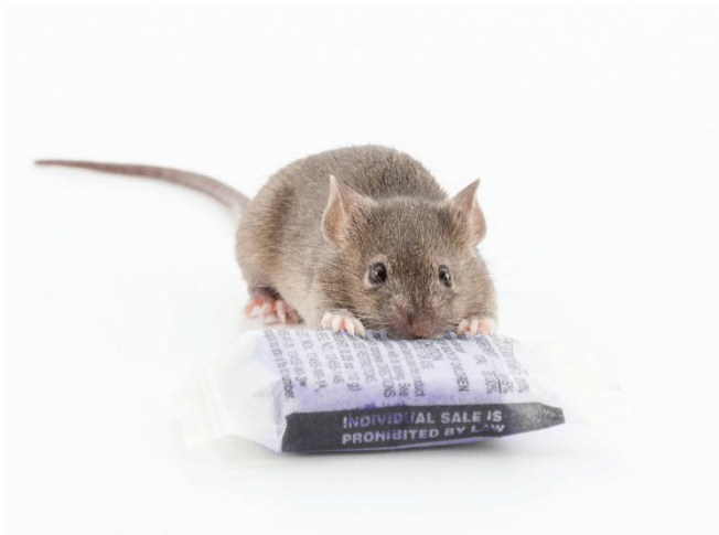
Photo may not be representative of a label-consistent bait placement