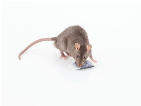
Photo may not be representative of a label-consistent bait placement