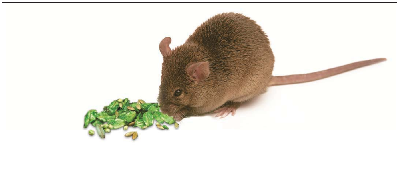
Photo is not representative of a label-consistent bait placement