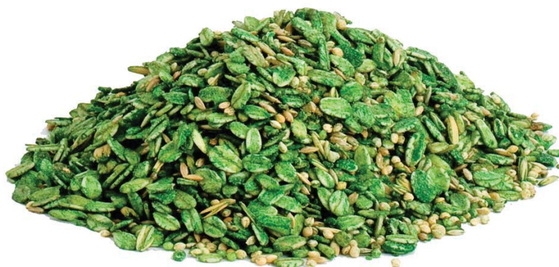
Photo is not representative of a label-consistent bait placement