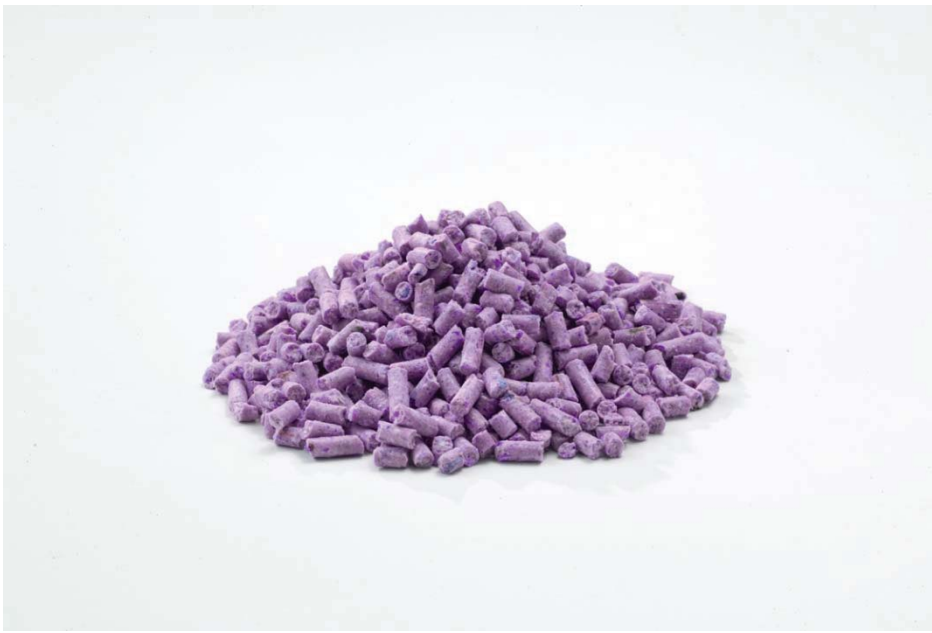
Photo is not representative of a label-consistent bait placement