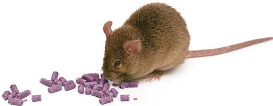
Photo is not representative of a label-consistent bait placement