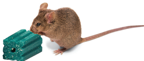
Picture not representative of Bait Placement. Bait stations are mandatory for outdoor, above ground use.