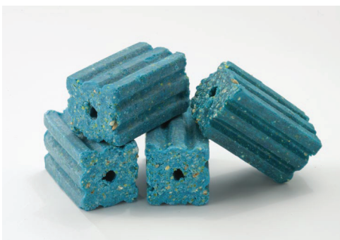
Picture not representative of Bait Placement. Bait stations are mandatory for outdoor, above ground use.

Bold, italicized text is information for the reader and is not part of the label.