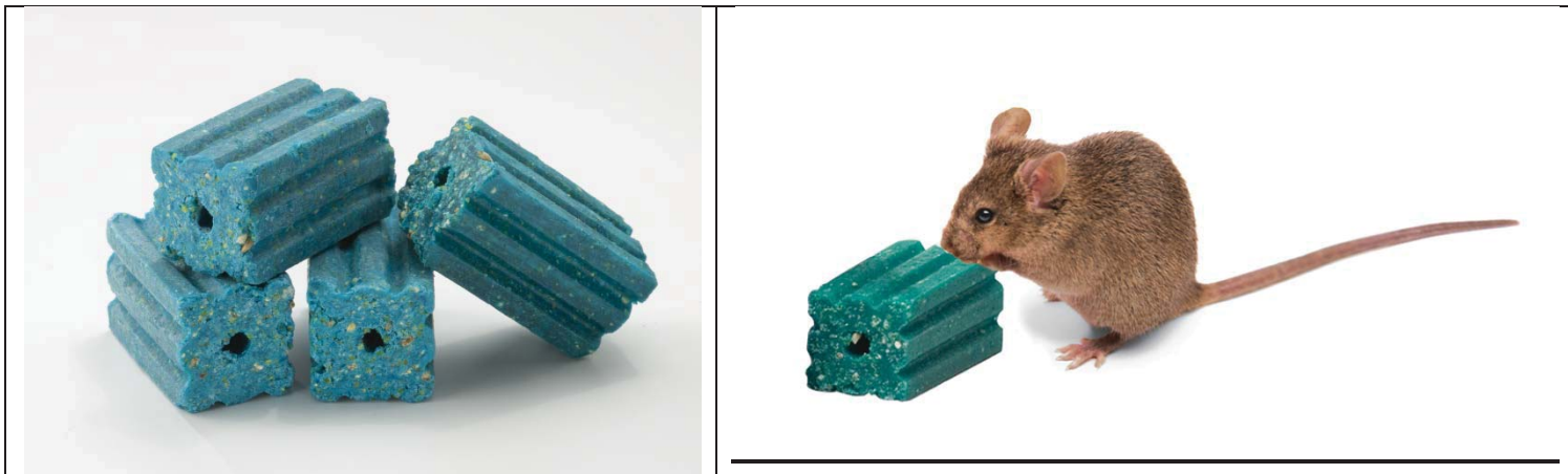
4 blocks is a rat, not a mouse, placement