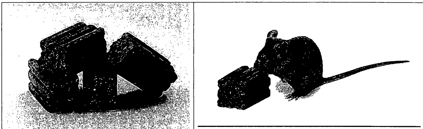
4 blocks is a rat, not a mouse, placement