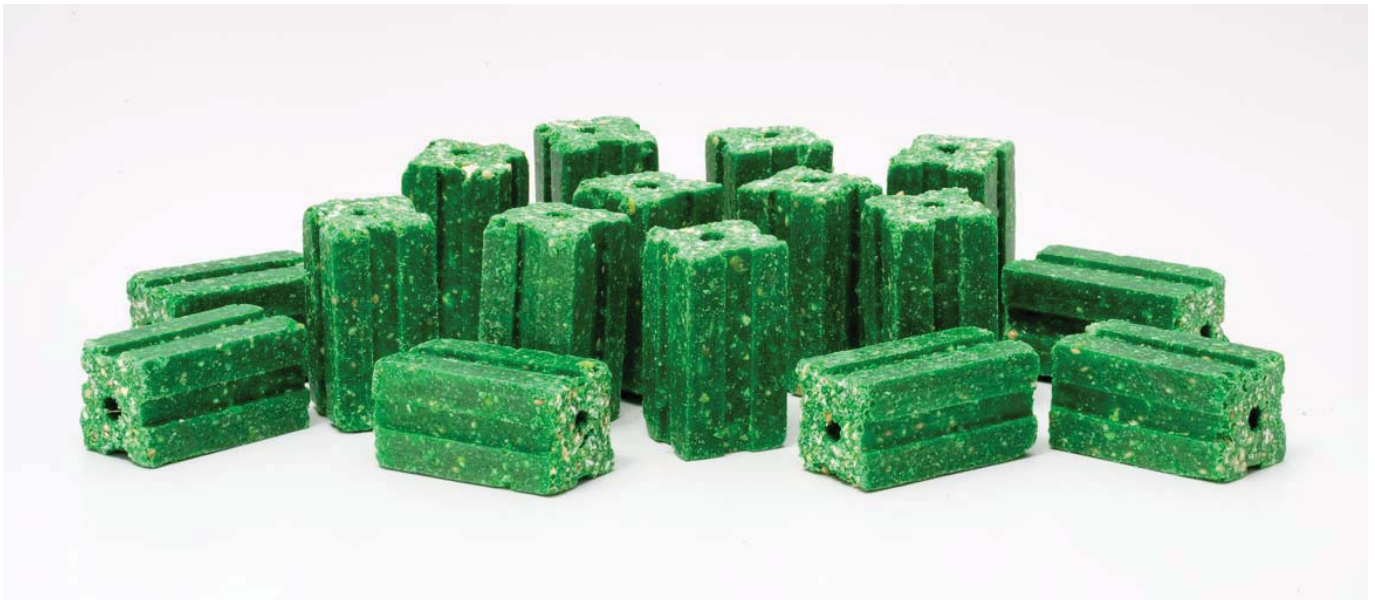
Photo is not representative of a label-consistent bait placement