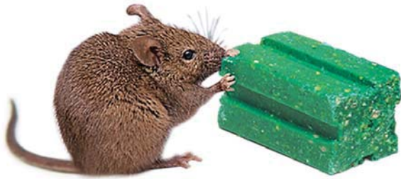
Photo is not representative of a label-consistent bait placement