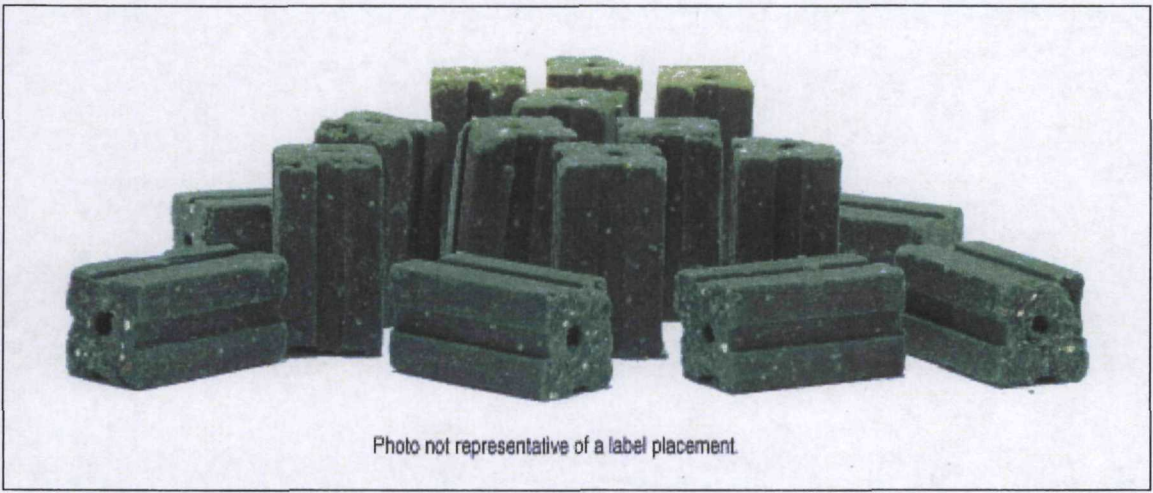
Photo not representative of a label placement.