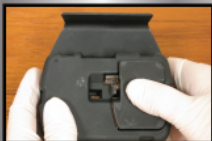
Push cartridge into station until it clicks into place.

Bold, italicized text is information for the reader and is not part of the label.