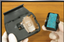
Place bait into cartridge.