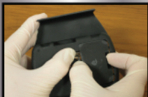
While still holding tab, squeeze prongs of bait cartridge and pull away from station.