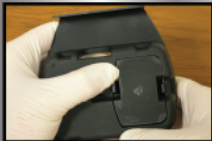
With your left hand push tab up.