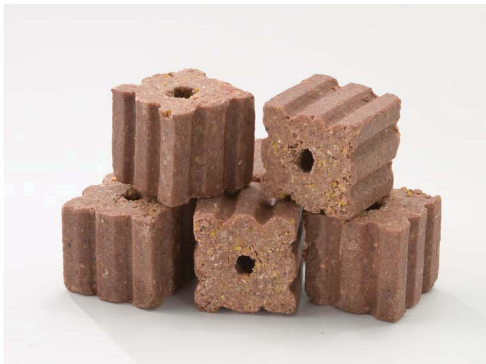
Photo is not representative of a label-consistent bait placement