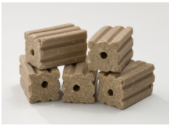
Photo may not be representative of a label-consistent bait placement