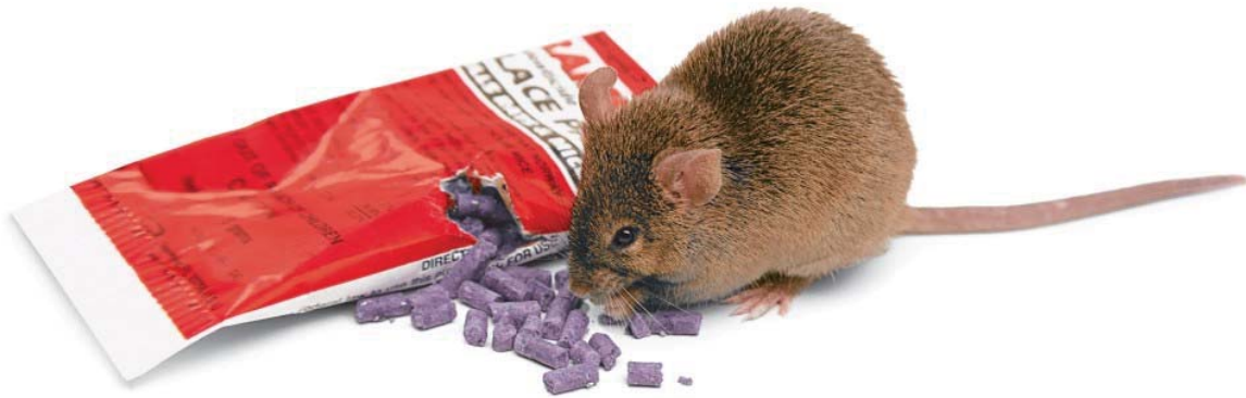
Photo is not representative of a label-consistent bait placement