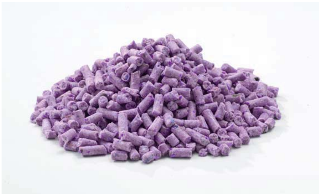
Photo is not representative of a label-consistent bait placement