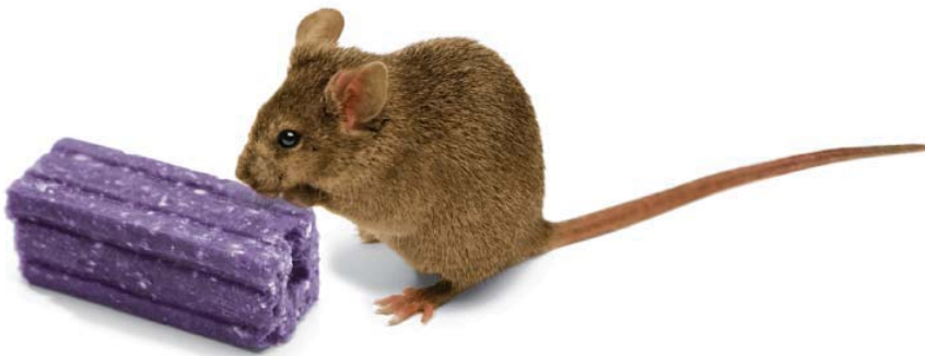
Photo is not representative of a label-consistent bait placement

All-Weather Bait Blox Reliable, All-Weather Formula Reliable, All-Weather Formulation Ready to use 0.53 oz. (15g) Bait Chunx Ready to use 0.53 oz. (15g) Bait Blox Multi-edge Shape Gives Rodents Gnawing Edges Can be Used Indoors or Out Can be Used in Tomcat Bait Stations Can be Used in Protecta Bait Stations Designed for Use in Tomcat Bait Stations Designed for Use in Protecta Bait Stations Made in USA Vibrant Purple Color