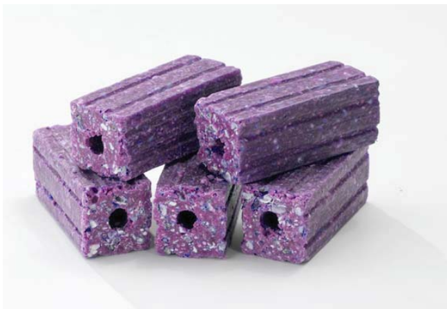
Photo is not representative of a label-consistent bait placement