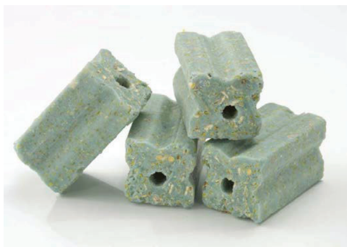
Picture not representative of Bait Placement.

Bold, italicized text is information for the reader and is not part of the label.